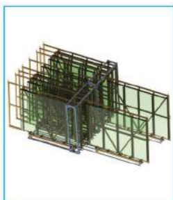
抽屉式仓储架 Drawer type storage rack