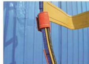
防割层粘布细节图