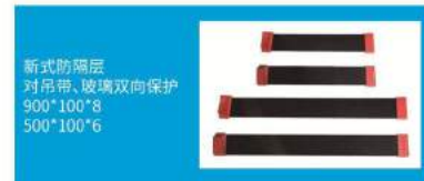
新式防割层 对吊带、玻璃双向保护 900*100*8 500*100*6

天津市日昇源玻璃技术有限公司从事玻璃行业30年，经过不断改进优化，生产出了中国质量最好、设计最合理的玻璃吊带。本产品采用高强度涤纶丝为承载芯，同时在内层玻璃接触部位添加了两道高新技术材料作为防割层，耐割耐磨，并独创设计了可终生使用的R角全钢垫板底座，产品设计符合力学原理，分散负荷，细节完美。该吊带比同类产品重9公斤，使用寿命可延长2倍，本产品已申请国家专利(专利号:201430200860.0)保护，并由太平洋保险公司承保。