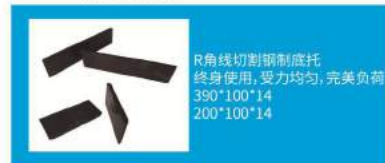
R角线切割钢制底托 终身使用，受力均匀，完美负荷 390*100*14 200*100*14