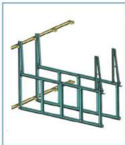
双层木箱仓储架 Double-layer wooden box storage rack