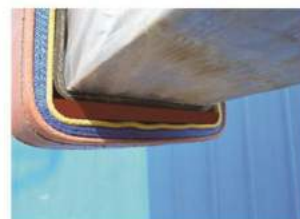
底座和防割层实际使用细节图