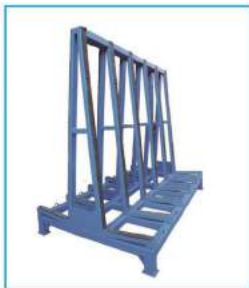
车间用连体A架 One-piece A frame for workshop