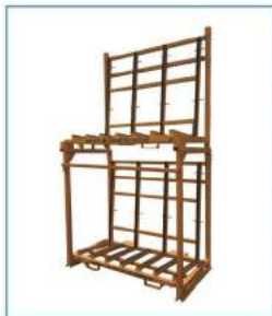
可叠放L架 Stackable L-frame