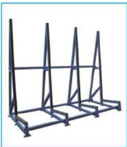
可拆卸上片AL架 Removable upper sheet AL frame