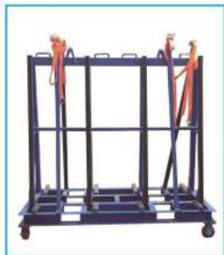
可拆卸连体A架 Detachable conjoined A-frame

我公司实力雄厚,有专业的设计团队,可根据客户构想和要求,为客户量身打造。 Our company strength is abundant,has a professional team,we can according to customer's idea and requirements,tailored for the customer.