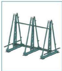
集装箱海运架 Container shipping rack