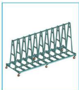
移动连体A字架 Moving conjoined A-frame